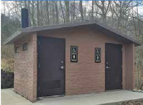
TIOGA SPECIAL Mocha Caramel Split Face Block Walls Malibu Taupe Cedar Shake Roof