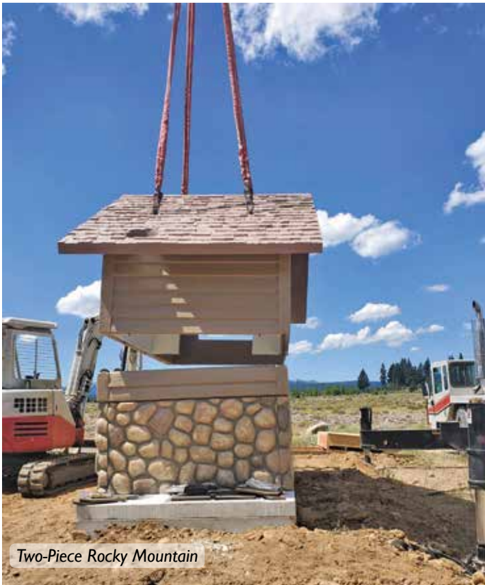
Two-Piece Rocky Mountain

CXT® vault restrooms are engineered and designed for long life in extreme conditions.