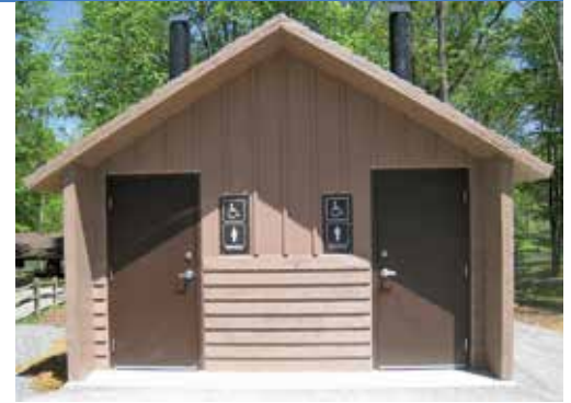
DOUBLE CASCADIAN Oatmeal Buff Horizontal Lap Walls and Cedar Shake Roof