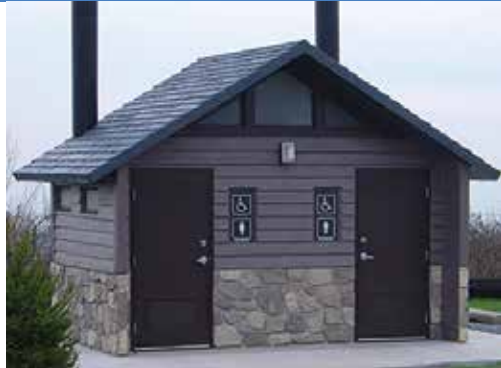
DOUBLE ROCKY MOUNTAIN Cocoa Milk Board & Batt Upper Walls Napa Valley Sone Lower Walls Granite Rock Cedar Shake Roof