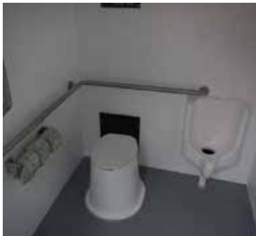
With optional urinal