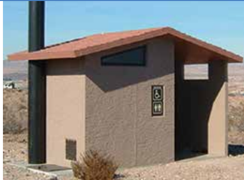
GUNNISON Sand Beige Stucco Walls Pueblo Gold Cedar Shake Roof