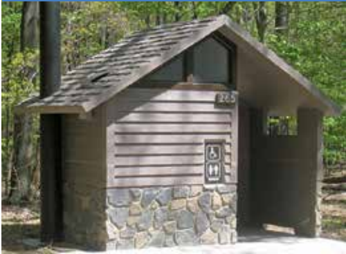
ROCKY MOUNTAIN Mocha Caramel Board & Batt Upper Walls Basalt Rock Lower Walls Mocha Caramel Cedar Shake Roof