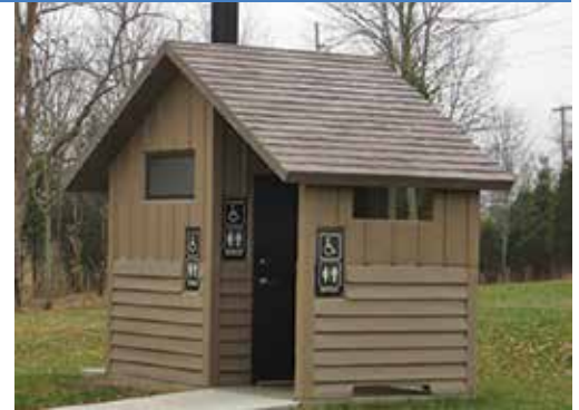
CASCADIAN Natural Honey Board & Batt Upper and Lap Siding Lower Walls Toasted Almond Cedar Shake Roof