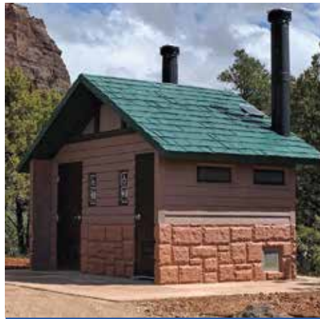
DOUBLE ROCKY MOUNTAIN